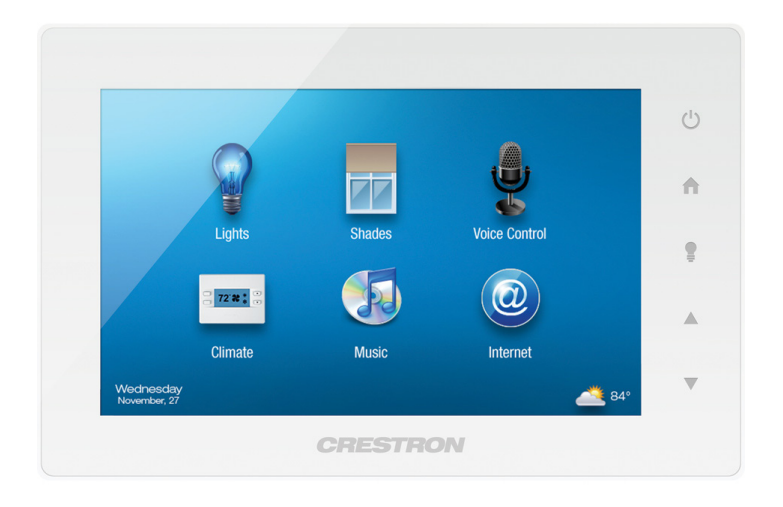
TSW-552-W-S - Shown in White