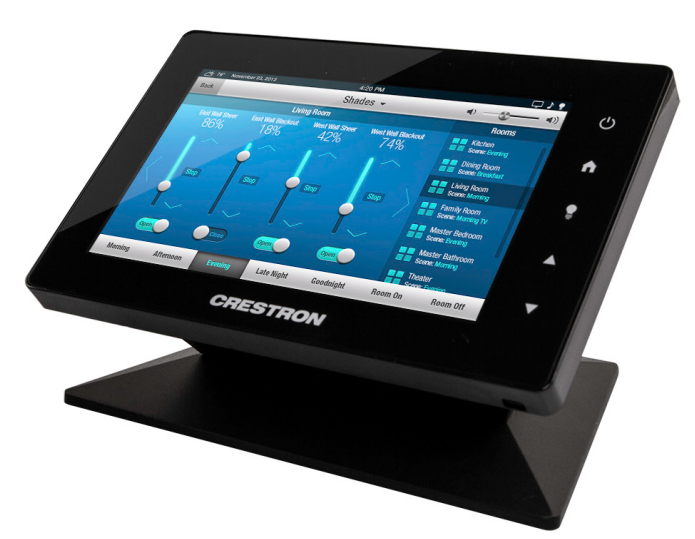
TSW-552-B-S with TSW-550-TTK TableTop Mounting Kit

Its built-in Web browser allows the TSW-552 to be used to access the Internet, providing a useful utility for quickly checking on social media sites, online auctions, stocks, sports, and other online information.<sup>[1]</sup>